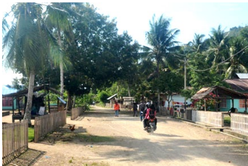
Figure 5.- Degu Degu in the front yard of Waeyoho Village

The only ritual in the fishermen cultural system is Sasi Laut which is carried out by the King of Negeri Kawa. Sasi Laut is one of the rituals that reflect the local wisdom of Maluku community in environmental conservation efforts. This activity aims to