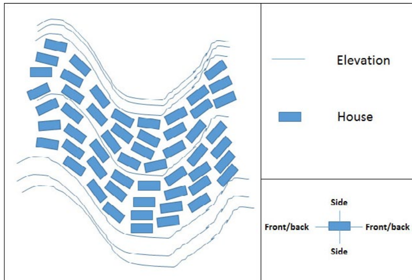
Figure 2. The Orientation of Buton settlements that follow the contours and cliffs

have been hereditary in Maluku so-called natives of the island/ traders (not a native of the area), they still occasionally return to their area (Adam 2010; Barter 2015).