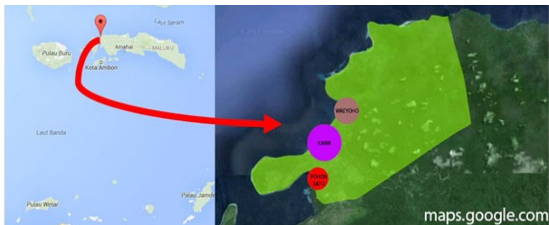
Figure 1. Research Sites in Negeri Kawa: Kawa, Waeyoho and Pohon Batu Villages

Negeri (village) Kawa is a custom village which is located on the western tip of Seram Island in Maluku Province. The landscape of Negeri Kawa is unique because it is formed spontaneously by three large ethnics spreading in five villages. The three ethnic groups are from Maluku, Butonese, and the most recent one is Javanese. Each ethnic group's cultural landscape pattern forms their own character, although all of them remain under control of the King of Kawa as traditional leaders and chief of Negeri Kawa.