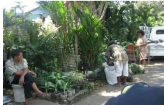
Figure 3. Ornamental plants in Lamper Lor.

Ornamental plants. Street vendors selling flowers and ornamental plants are only in Pasar Kembang (near RSUP Karyadi) and in Lamper Lor (see Figure 3). In an open stall, traders are grouped with semi-permanent buildings.