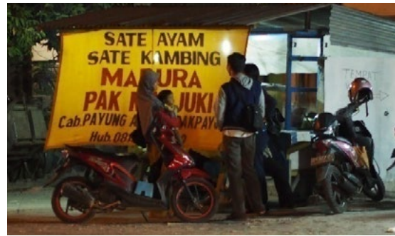
Figure 1. Culinary street vendor in Tembalang

Culinary. Food vendors dominate type of street vendors in the city of Semarang, i.e., more than 64.94% selling various kinds of food from within Semarang and from surrounding area. The sample can be seen in Figure 1. Based on the food sold, there are at least three variations of time to operate the stall i.e., (1) The stalls that operate during the day, generally at 9:00 to 15:00, (2) stalls opening in the afternoon-evening, usually at 4 p.m. to 22:00, and (3) The stalls that open from noon till night, generally from at 9:00 a.m. to 21:00. The third variation of this trade show the variety of food sold. Stalls that operate during the day are usually a stall selling snacks such as ice juice, fruit salad, and others. While the stalls that operate in the afternoon-evening in the form of main course such as soup, kethoprak, kupat tahu, and others. The stalls that open during the day (day - night) usually are meatball stall.