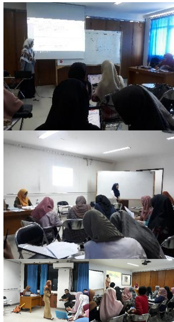
Figure 4. Teaching Practice

The next procedure in Lesson Study is the reflection (reflection/ see) on the planning and implementation of teaching-learning/ practice, to improve the quality of learning carried out by students. This process allows students to repack