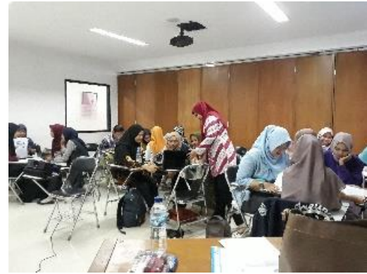
Figure 3. Guidance and explanation from the lecturers