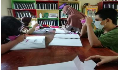
Figure 1. Sample Feasibility Test for Braille Geometry Teaching Materials at Bina Insani Special School.

From the results of a small trial of braille geometry teaching materials at MTsLB Yaketunis, 2 students gave decent scores and 3 others gave very decent scores. Of the 5 students who were given a feasibility questionnaire, it was seen that there were still students who were not used to using media in learning. This results in the existence of geometry media in teaching materials that students cannot use independently in learning. During the due eligible test activity, it was also seen that each student felt confused by the existing geometry shapes. With the teacher's explanation and assistance in directing students to be able to feel the geometry shape, students can touch the geometry shape being studied.