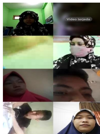
Figure 2. Online Trial Samples at MTsLB Yaketunis Yogyakarta

them more real in learning activities (Rudiyanti, 2015). The following is picture 2. A sample of documentation of a bold small trial at MTsLB Yaketunis Yogyakarta.