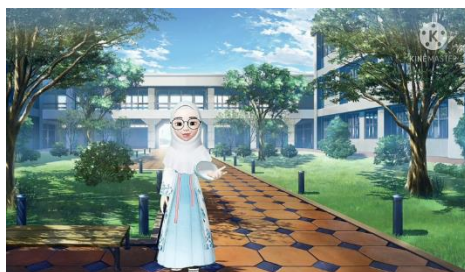
Figure 5. Greetings Display

Second, the core activity, which contains verses from the Qur'an and Hadith along with an explanation of their relationship with elementary linear algebra material. Furthermore, the presentation