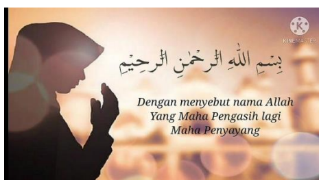
Figure 4. Prayer Display