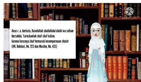
Figure 7. Display of the Presentation of the Verses of the Qur'an and Hadith

Third, the closing activity begins with the presentation of an animation that closes the learning video with motivational sentences and closing greetings. Furthermore, the learning video ends with a closing video display.