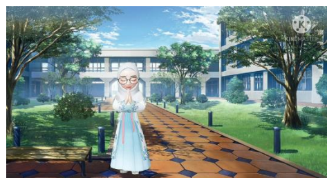
Figure 7. Closing Greeting Display

Third, the closing activity begins with the presentation of an animation that closes the learning video with motivational sentences and closing greetings. Furthermore, the learning video ends with a closing video display.