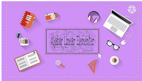
Figure 2. Video Opener View

cols, because this learning video was developed at the time Covid-19 pandemic. The next part in the introductory activity is reading a prayer before starting the lesson. Then proceed with an animated display that opens a learning video with greetings and greetings.