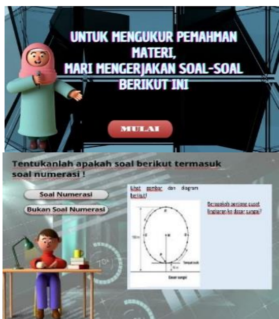
Figure 4 (See Figure 4) evaluates the understanding of MCA numeracy in the Interactive E-Module. Its application is through the submission of questions based on the indicator. Application of interactive evaluation activities so that respondents can determine whether the answer choice is correct or wrong.