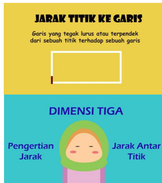
Figures 4 & 5. Animation-Based Learning Video Results

tools because they can have each of them. In addition, this learning media are also easy to obtain and can be seen repeatedly anywhere and anytime, which can make students' mathematical literacy increase and can make students' imaginations develop. In the long term, students are expected to have their own interest in learning mathematics. As a result, students realized that learning mathematics was no longer considered a difficult and rigid subject that dealt with numbers and numbers alone. But on the contrary, mathematics is one of the memorable subjects and can also be learned through media and applications as a group of other subjects that are not only struggling in books and struggling with formulas.