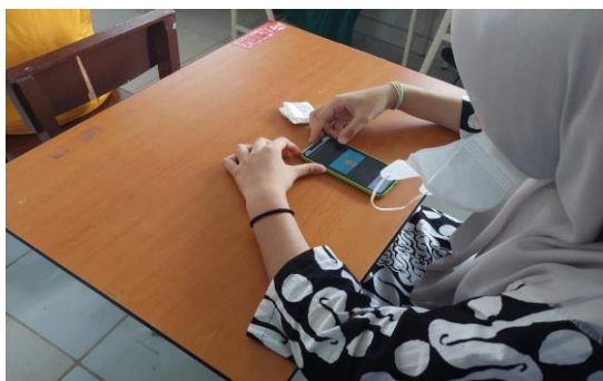
Figure 4. Students Watch Animation-Based Learning Videos

Furthermore, at the assessment stage, a trial will be carried out on prototype 2 to find out the practicality and effectiveness of animated video-based learning media. In this assessment phase, there are two stages of trials, namely limited trials, and extensive trials. First, a limited trial was carried out by providing animated video-based learning for 10 students of class XII MIPA 1 on August 9, 2022. The purpose of the limited trial to 10 students is to see the practicality of learning media developed in a limited scope through a response questionnaire that will be filled in. In the limited trial, 10 students were allowed to watch three animation-based learning videos.