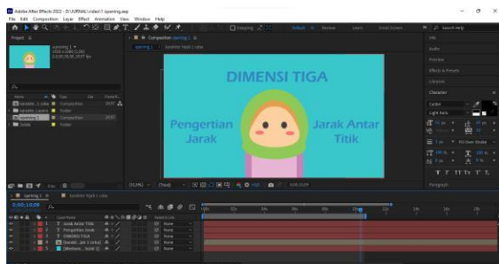
Figure 3. (Prototype 2)

Opening Character of The Distance Between Points on Prototype 1 And Using The Comic Sans MS font