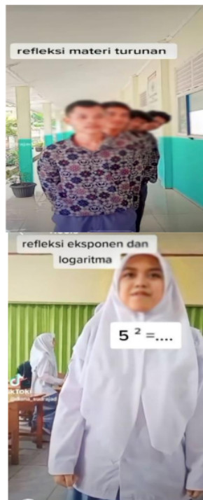
Figure 2. Students answering questions