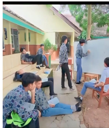
Figure 3. during the student discussion process

When we made observations when the discussion process was carried out, we saw how the collaboration skills of each group that had been made, there was still a very visible gap between students who actively interacted and students who only listened quietly. So that with the above conditions these students need growth motivation, where growth motivation or metaneeds encourages students to realize their potentials (Meliala, Timoteus S.; M. Sastrapratedja, supervisor; Soerjanto Poespowardojo, 1988). At this stage, it can be seen that low-achieving students find it difficult to show their contribution from their point of view. In fact, when given their motivation to answer questions about derivatives, they seem ambiguous and tend to fear being wrong. These children who are bad at math often keep their heads down and smile only when talking to other children in the class. These children must be motivated first so that they want to give their opinion and the encouragement of their peers to want to speak up in the discussion.