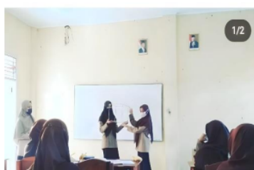
Figure 5. Students explain the results of creative ideas in learning mathematics.

In this last stage, quite good developments were carried out by students of class XI IPS SMA TRI SUKSES, students were able to demonstrate their collaboration skills quite well, starting from compiling creative ideas that had been designed and poured into an application or media.