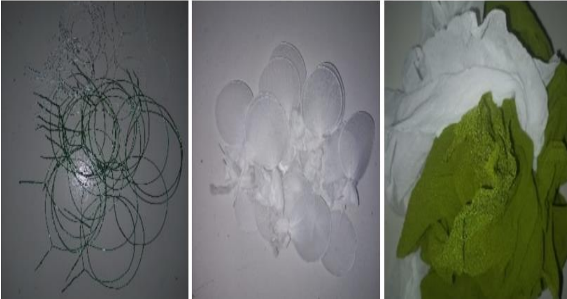
Figure 2. Materials for Making the Chinese Handicraft (Camellia Sinensis)