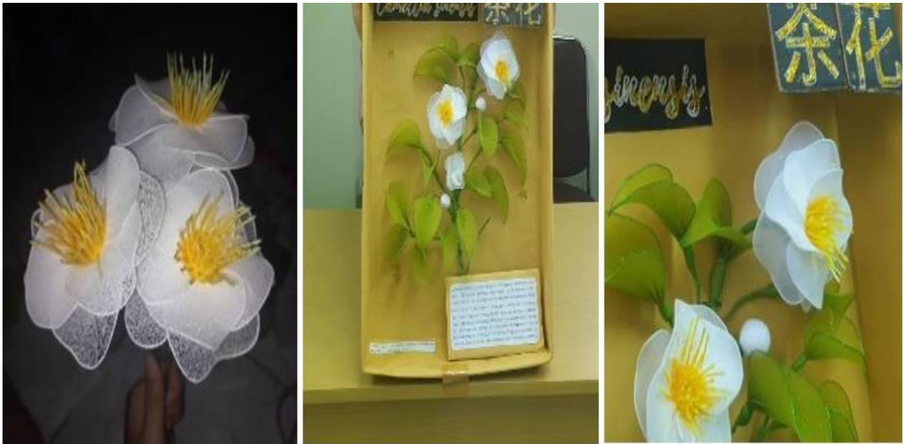
Figure 3. Product of the Chinese Handicraft (Camellia Sinensis)

learner's commitment, creative imagination, and capacity to turn ideas into reality, creating a lasting impression on both the creator and those who engage with the finished product.