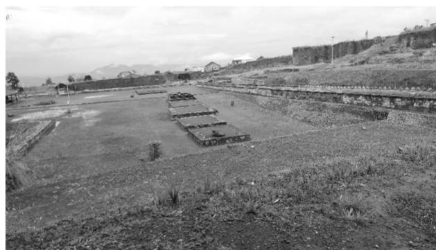
Figure 2. Overview of the Liangan Site

gency has a tropical climate with two seasons, namely the dry and the rainy season. Temanggung is a complex area, ranging from plains, hills, mountain ranges, valleys and mountains. Temanggung Regency has two mountains, namely Mount Sindoro and Mount Sumbing ( Profil Kecamatan Dan Desa , n.d.).