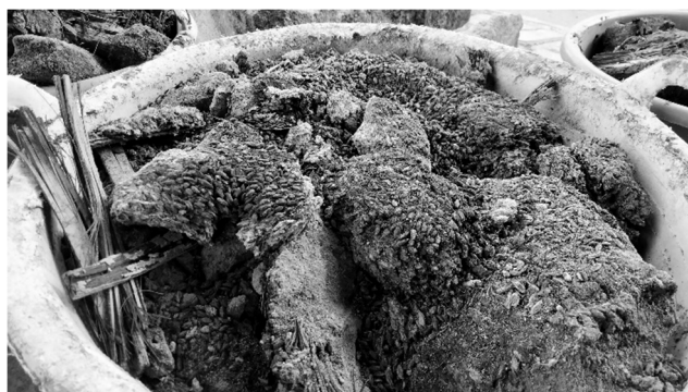
Figure 3. The discovery of burned rice at the Liangan Site

The name Liangan comes from the word " lilihan ", which means moving. The residents of Liangan Hamlet are moving from an area because they are looking for a safe place to avoid spirits. This strengthens the opinion of Wanua I Rukam who says that Liangan Site is a village that "moved" from its original village due to a volcanic eruption. It is estimated that the eruption of Mount Sindoro burying Liangan Site occurred before 907 AD (Abbas, 2016). Liangan Site is a site that was discovered in late 2008 by sand miners (Riyanto, 2017). Liangan is a relic site of the Ancient Mataram Kingdom in the 9-10 century AD. This site has a complex residential component, namely residential areas, Hindu worship areas, agricultural areas, and workshop areas (Riyanto, 2015).