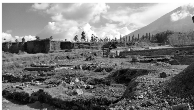
Figure 1. Liangan Site which is located in the sand mining area