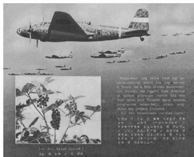
Figure 3. Japanese administration propaganda poster on castor cultivation

The Japanese utilized social organizations such as the Tonarigumi (neighborhood association), Seinendan (paramilitary organization), and