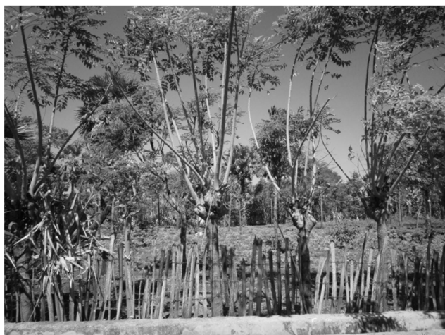
Figure 5. The application of legume trees as hedges in rural Indonesia (Source: Henky Widjaja).

women to spend longer time to collect fodder for their livestock.