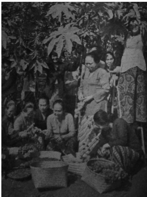
Figure 5. Women and buckets of the harvested castor fruits with castor trees as the background (Source: Marilah Menanam Djarak! Book, circa 1943).

The description presented in Danquah's article is a useful reference in studying the alternative fuel policy by Japanese military in Indonesia at that time, especially regarding the exploitation strategy. There are similarities of story lines on the exploitation strategy on both voluntary and forced castor cultivations in Indonesia. After the Japanese occupation ended, farmers immediately abandoned their castor farms and shifted back to the food and cash crops cultivation. Yet, castor is continued to be grown in several places in Indonesia after the independence as an industrial crop.