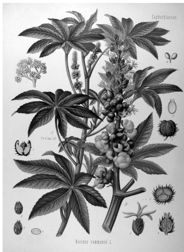
Figure 2. The sketch of Ricinus Communis L.

One main caveat in studying the history of jatropha is the common misidentification of jatropha as castor plant, either written or verbally, where both plants are commonly addressed using similar names: jarak and castor. It is noted that prior the jatropha hype in the first decade of 2000s, most literatures refer castor plant as jarak , and the two names were used interchangeably. Furthermore, in many places in Indonesia the two plants are addressed as jarak by the local people despite of their significant differences. Jatropha curcas and castor are both oil producing plants from the same