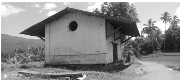
Figure 4. Former Train Station in Nagari Sumpur