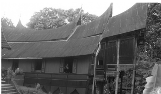
Figure 5. Rumah Gadang in Nagari Sumpur (source: researcher documentation)