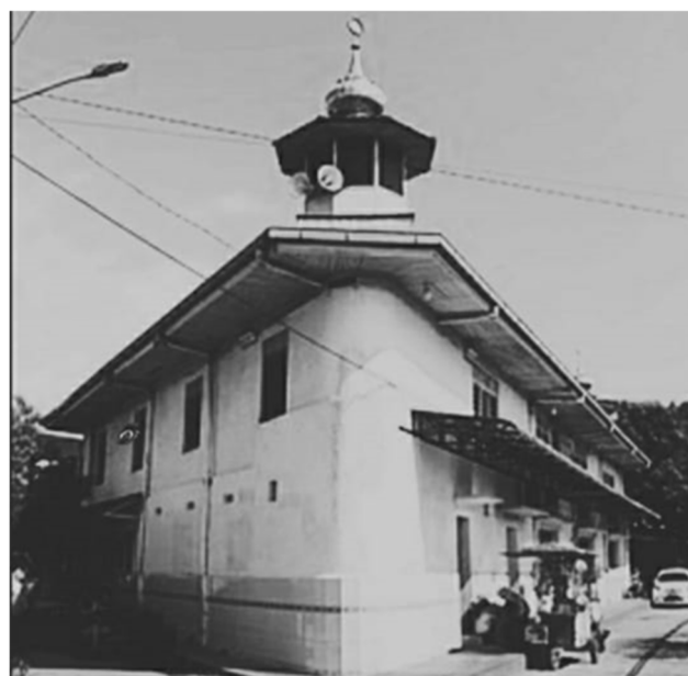
Figure 3. Surau Sumpu