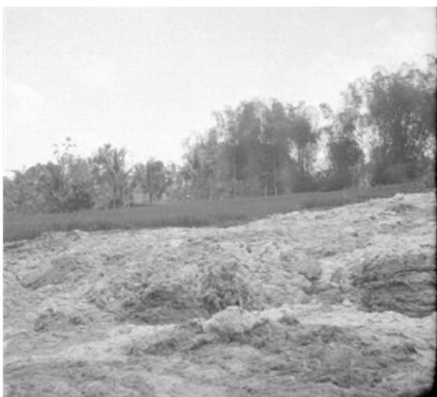
Figure 6. Plants that Live in the Highlands

Coffee plants do not need many protective plants when still teenagers or adults. Protective plants were getting reduced; thus, there was a shift in the plants in the Mento Toelakan plantation. Other plants already exist in the area were gradually being evicted to grow coffee cultivation. The opening of the Mento Toelakan plantation may have started from the north side of the area. It is referred to in terms of the contours of the Mento Toelakan area, which were very diverse. The northern area of Mento Toelakan was a sloped area of Mount Lawu, which had a higher contour when compared to other areas. The coffee plantations on the north were probably mountainous areas, and the supporting plants were on the south side of the plantations.