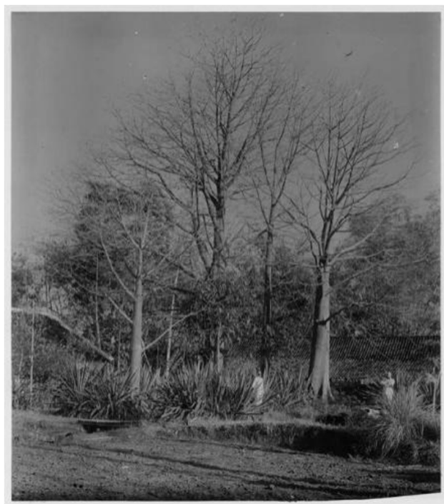
Figure 8. Kapok in Mento Toelakan Plantation.

Plantation land became a magnet that attracted Europeans or Indos (Eurasian) to live at Mento Toelakan. Europeans or Indos settled and married local people. Some of the evidence is the family grave and also the family tree. Europeans and Indos residing in Mento Toelakan lived in groups near the administrator's office, commonly