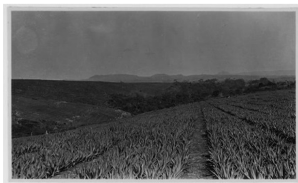
Figure 4. Condition in northern Mento Toelakan, circa 1930

Mento Toelakan was planted with coffee, and other crops such as sugar cane, pepper and tobacco were added. Coffee dominated the early plantations