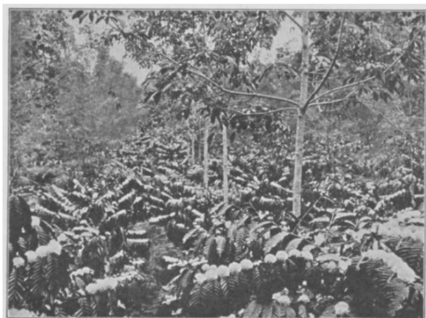
Figure 5. Young coffee plants that need big plant protection