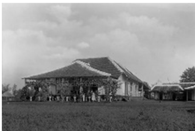
Figure 7. Mento Toelakan Plantation Administrator's Office