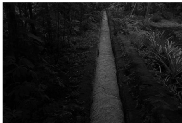
Figure 12. Irrigation Channels in Mento Toelakan

in Wonogiri. One of the most visible and felt impacts was the onset of flooding in several areas. Whereas previously there had never been any reports of flooding, flooding has occurred since the forest's function has changed.