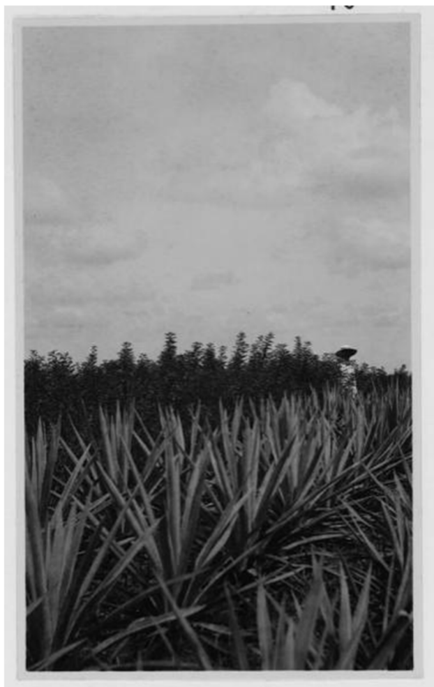
Figure 9. Agave Forest in Mento Toelakan

more commonly known as pineapple fibre, Javanese people call it nanasan , or konas rope material, is an annual plant. Two fibre plants dominated Mento Toelakan: Agave cantala and Agave sisalana . These two types of Agave have different characters. Agave Sisalana is 5-10 years old, while Agave cantala can last 10-15 years and grow to 4-8m (Iterson Jr, 1917, p. 13).