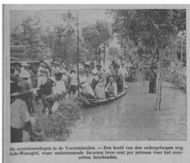
Figure 11. Flood in Wonogiri 1937

The 1937 flood showed evidence of the real impact of ongoing deforestation in Wonogiri. This flood caused the paralysis of transportation routes from Wonogiri to Sukoharjo or Solo. One of the affected points was the area around Mento Toelakan because this area was in the Wonogiri-Sukoharjo border area. In addition, changes in the Wonogiri forest directly impacted the environment