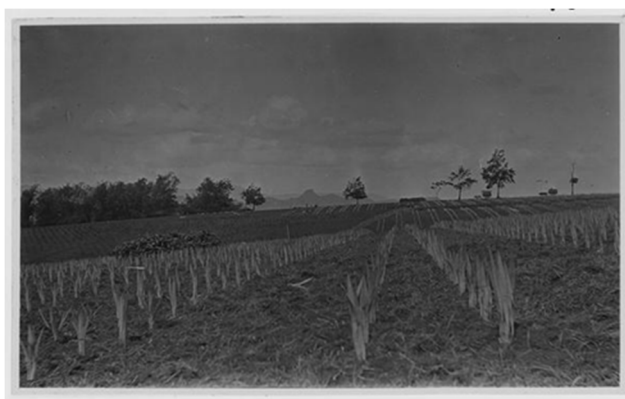
Figure 10. The Condition of Mento Toelakan Plantation during Agave Sp. Regeneration

Exploited land had an impact on the environ-