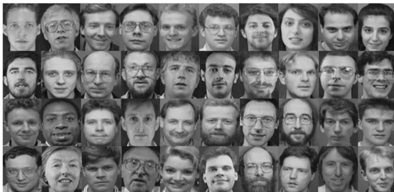
Figure 1. Samples of AT&T’s Face Image

In this study, the application of methods is done by using MATLAB R2015a. Face data taken from AT&T “The Database of Face” (previously called ORL database). There are 40 subjects or classes where each class consists of 10 face images so that the total amount of data is 400 images face. This entire face image will be divided into training data and testing data. The images are taken with a dark background and upright position and facing forward (with tolerance for some changes to the taking of the face angle). These files are in the format of PGM and size of each image is 92x112 pixels with grey levels 21 for each pixels. Samples of AT&T’s face image can be seen in Figure 1.