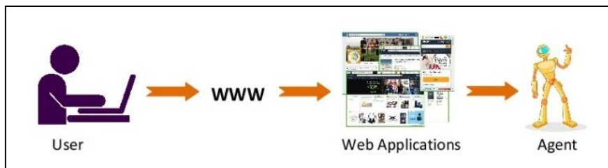
Fig.3 User Access Web Applications as IWA

The analysis and expectation that intelligent application development will progressively undergo revolution is owing to the accessibility of the large-scale semantic web, which originates from next-generation SWA. In section 4, IWA has been explained and presented. IWA's future is predicted to operate on human brain intensely, but at present, the effort is concentrated on thinking and mining. IWA consists of web mining, semantic web, web personalization, and Intelligent agents. IWA's intelligent agent is an important feature, through which data is mined, as illustrated in Fig.3.