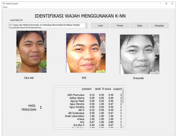
Figure 6. The results of identification using KNN

used for classification. Regardless of its simplicity, this method is quite effective as a classification. This method was first proposed by T. M. Cover and P. E. Hart in 1967 [13] but then modified to improve the performance of the KNN. The basic concept of KNN is to have several training samples and testing samples determined by members. If k=1, the testing sample is assigned to the nearest single neighbor class. However, finding the right k value for a particular problem is a problem that affects the performance of the KNN [14]. The classification stages in face identification systems use the K-Nearest Neighbor (KNN) method where the eigen image of the feature extraction process used as input is as follows.