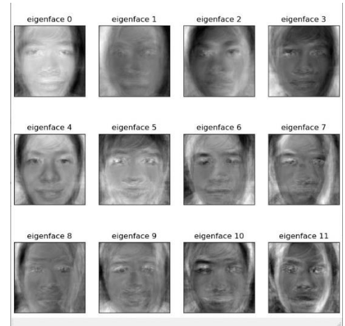
Figure 5. Feature Extraction using PCA

Feature extraction is a stage to find the characteristic features of an inputted image. Feature extraction is a process which is extracted features to encourage the classifier to make decisions when classifying.