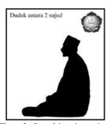
Figure 3. One of the print markers

The application of the Brute Force algorithm starts with knowing the name of the marker that is registered on the system in the form of a String. Then the String value will be matched with the String value contained in the database name. The following are examples of markers used.