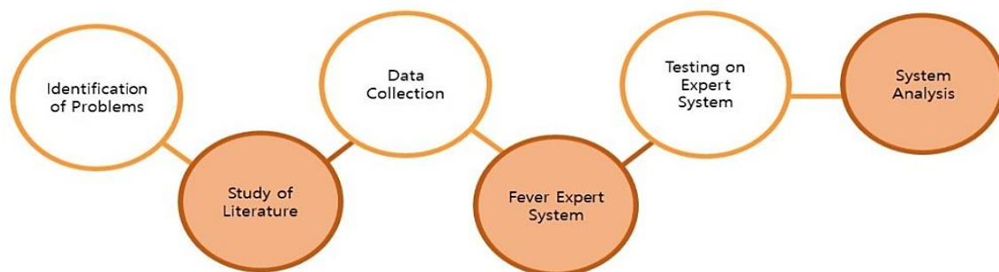
Figure 1. The Block Diagram on Fever Expert System Research

This expert system consists of several stages, namely problem identification, literature study, data collection, making a fever expert system, system testing, and system analysis as shown in Figure 1.