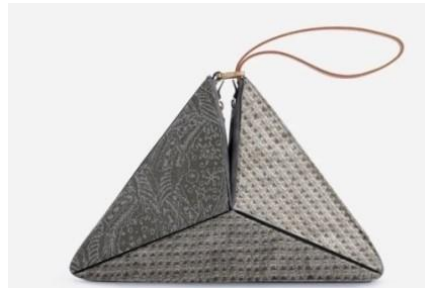
FIGURE 6. Bag design.

The recommended bag in FIGURE 5 combines Garut sheepskin and Garutan batik. Bags with geometric shapes, simple and not much detail, are designed for urban female users who need a simple bag to carry on activities because of its more active nature by using doobby technique Vetiver weaving material whose texture is quite soft, combined with a touch of Garutan batik peacock ngibing motif as the identity of Garut City. Garut sheepskin on the bag supports Vetiver weaving material so that the bag is sturdier when used.