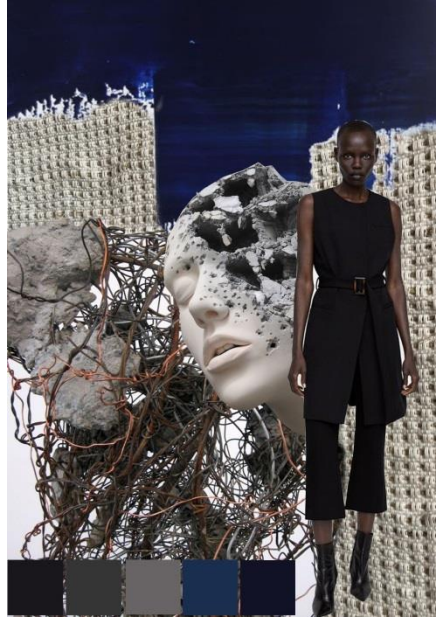
FIGURE 4. Moodboard

According to Bui's interpretation of Kobayashi's theory (2021), leveraging wordplay and color in design enables the identification of shared behaviors among individuals with distinct patterns. This approach allows us to perceive various lifestyles. In practical terms, designers can capitalize on the interplay between words, colors, and objects when crafting a new product to establish connections and resonate with diverse audiences. This method enables designers to tap into shared experiences and preferences, making the product more relatable and appealing to a broader spectrum of consumers.