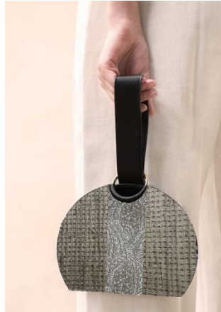
FIGURE 5. Bag design.

The recommended bag in FIGURE 5 combines Garut sheepskin and Garutan batik. Bags with geometric shapes, simple and not much detail, are designed for urban female users who need a simple bag to carry on activities because of its more active nature by using doobby technique Vetiver weaving material whose texture is quite soft, combined with a touch of Garutan batik peacock ngibing motif as the identity of Garut City. Garut sheepskin on the bag supports Vetiver weaving material so that the bag is sturdier when used.