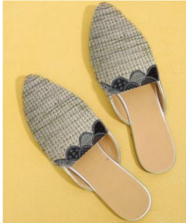
FIGURE 7. Slipper design.

The slipper in FIGURE 7 uses Vetiver weaving material and Garut sheepskin. They are designed for urban female users who need a simple slipper for activities because of their more active nature. They use the dobby technique Vetiver weaving material, whose texture is quite soft. Garut sheepskin supports Vetiver weaving material, so the slipper is more robust when used.