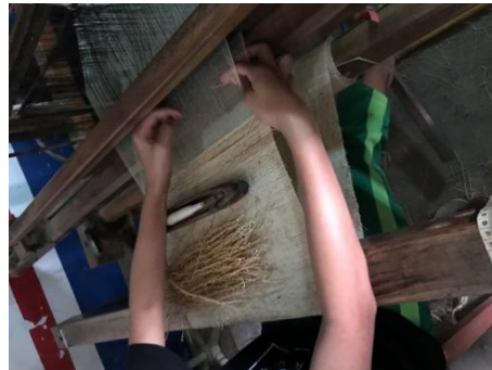
FIGURE 1. Vetiver weaving.

The limited access to markets can curtail the competitiveness of these products, hindering their successful penetration into both national and international markets (Sulastri, 2016). Expanding market reach becomes pivotal for ensuring the viability and success of these locally crafted goods amidst a competitive global landscape.