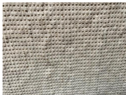
FIGURE 2. Vetiver weaving.

In Garut, businesses often stem from family traditions passed down through generations. They creatively adapt these traditions to suit contemporary demands, preserving traditional elements while staying relevant to modern trends (Arifin, 2016).