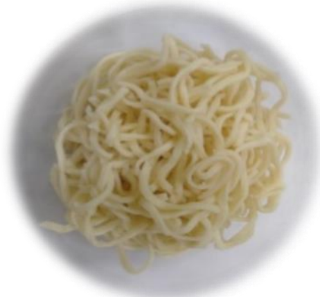
FIGURE 3. The addition of mackerel tuna meat produces wet noodles.