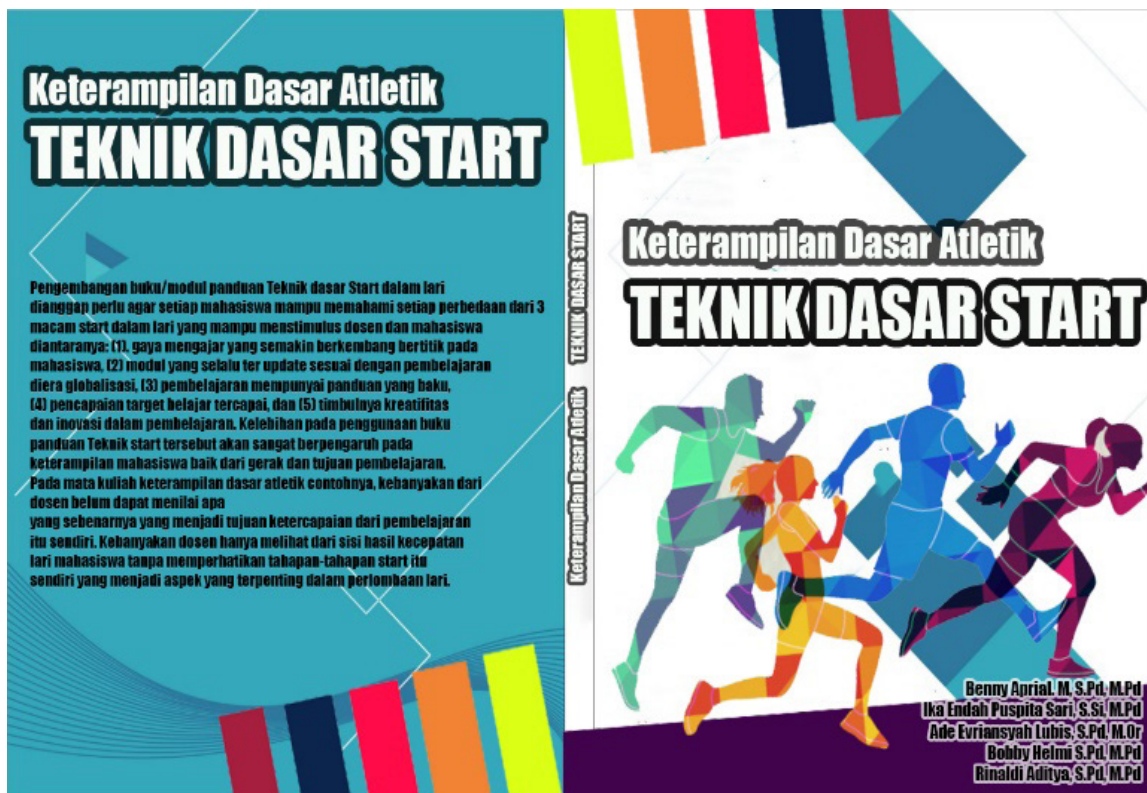
Figure 3. Book Cover of “Ketrampilan Dasar Atletik Tenik Dasar Start”

Overall, the book media of Basic Techniques (Bunch Start), Medium Start (Medium Start), Long Start (Long Start) for Students of Athletics Subjects is feasible to use after two stages of trials have been carried out. This development research can be used to add references for lecturers and students, coaches, and athletic athletes, as well as the general public in learning more about basic athletic start techniques.