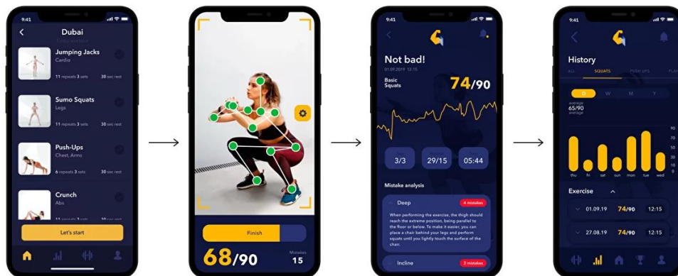
Figure 7. ArtiFit

ArtiFit is an intelligent computer vision fitness assistant for tracking exercise techniques that automatically recognizes the movements of 20 of the human body's major joints. Using the user's smartphone camera in real-time, the app offers corrections for up to five exercise joints per pose. (More than 80% of the most frequent errors) If a user makes an error, they will be instructed on how to exercise correctly. Simultaneously, the user can control themselves using real-time augmented reality images of their body. On the smartphone's display, ArtiFit will automatically edit and display the exercise duration, number of repetitions, score of overall exercise efficiency, and common errors by analyzing the user's exercise results. The membership fee is approximately $5 per month. [18].