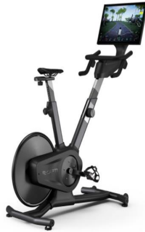
Figure 2. Capti launches new ‘game-changing’ smart bike