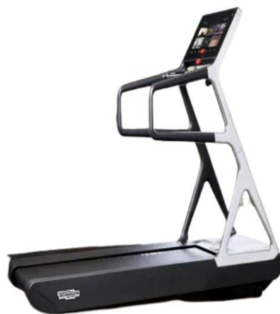
Figure 1. Compact

A treadmill with a refined and compact design, an adaptive running surface, and tablet-based custom training sessions. This is high-tech exercise equipment for users who want to train quietly at home without disturbing neighbors, such as a treadmill with a motor-driven drive system. This makes it possible to practice without disturbing others early in the morning or late at night. This exercise machine connects to a virtual trainer via a 21.5-inch display. Which can select required programs. Including the following features: personalized training from a tablet, Technogym session, Technogym routines, Technogym Outdoor, Technogym music playlist, Treadmill running biofeedback, and running improvement. It features built-in speakers that enable users to connect their devices to the system to play music or stream content. Shock absorbers are incorporated into the running surface to increase comfort and prevent injuries. The monthly cost is approximately $1,345.77, or $16,298.78 annually. [12].