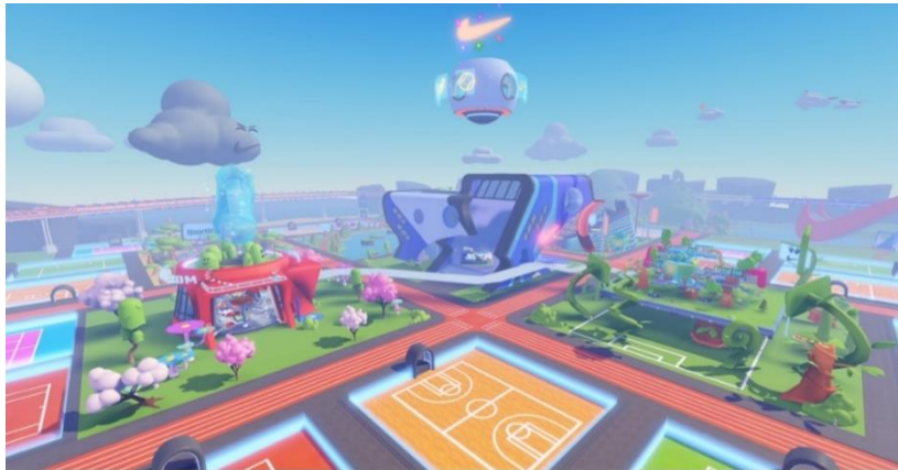
Figure 8. NIKELAND Metaverse

Nike and Roblox (an online gaming platform) have collaborated to create a virtual world called "NIKELAND." The game "The Floor is Lava" was derived from tag and dodgeball. These games were modeled after the company's Beaverton, Oregon headquarters. Comparable to world-class athletic competitions such as the World Cup and the Super Bowl, the time between games resembles these events. Nike has stated that it will continue to incorporate its athletes and products into the virtual world. Additionally, users can enter a virtual fitting room to virtually try on Nike apparel. The NIKELAND website is currently promoting special items such as headwear and backpacks [19], regardless of whether they are the most recent or newest versions.