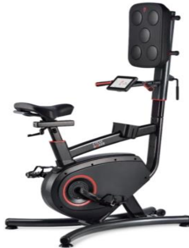
Figure 4. CYCLE BOXER - Upright Bike with Boxing Pad