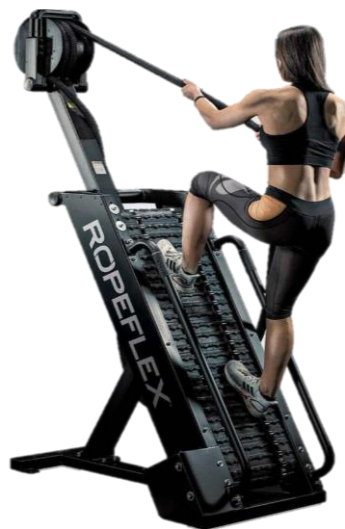
Figure 3. The Ropeflex APEX RX4400 Tread Climbing Rope Machine is Intense

The Ropeflex APEX RX4400 tread climbing rope machine is a novel piece of training equipment that will enable athletes to engage in an analog activity with greater professionalism. The machine has an integrated rope that the athlete must climb, while the integrated vertical treadmill track provides a portion for them to pedal while moving in place. The modular design of the exercise equipment will enable consumers to use each component separately for a customized workout. The resistance on the Ropeflex APEX RX4400 tread climbing rope machine is adjustable between 40 and 250 pounds, and its commercial-grade construction allows it to be used in public gyms. The cost is approximately $7,261.35 . [14].