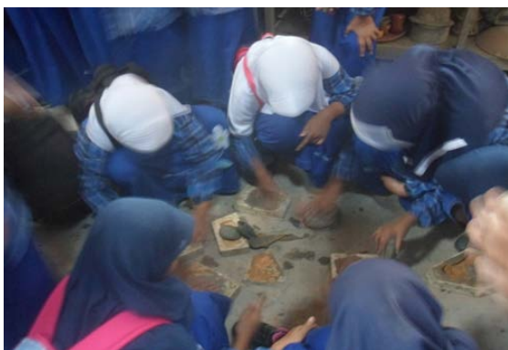
Figure 3. The Learning Process

The learning method mostly uses powerpoint presentation to display brief introduction to students along with the projection of ceramics product. After the projection, the teacher asks the students question