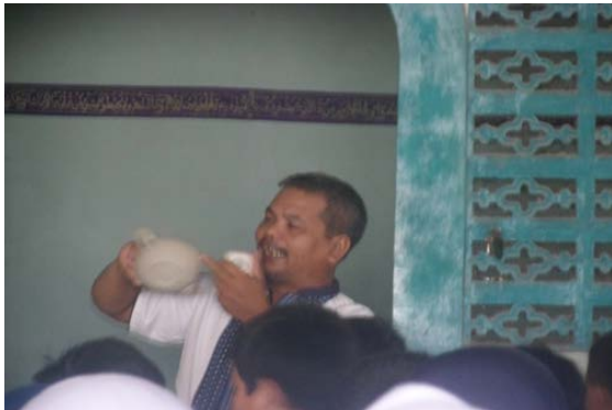
Figure 1. The Learning Process

projection, the teacher asks the students question to evaluate the materials. Then, the students answer the questions.