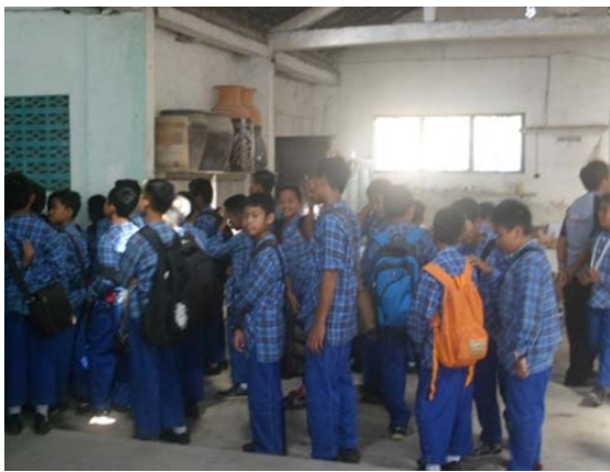
Figure 2. The Learning Process