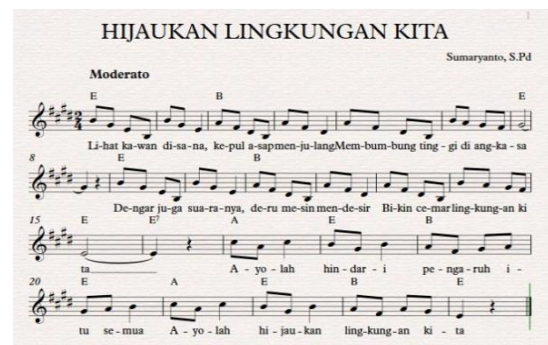
Figure 2. Score of Hijaukan Lingkungan Kita (Let's Green Our Environment) song

The next nature-themed song is entitled Hijaukan Lingkungan Kita (Let's Green Our Environment) song, by reading the title alone, everyone can conclude the story in this song, which is about the invitation to protect the environment that is getting damaged due to noise and smoke from factories and illegal logging. The Hijaukan Lingkungan Kita (Let's Green Our Environment) song has the character value of caring for the environment, which can be seen in the lyrics as follows: