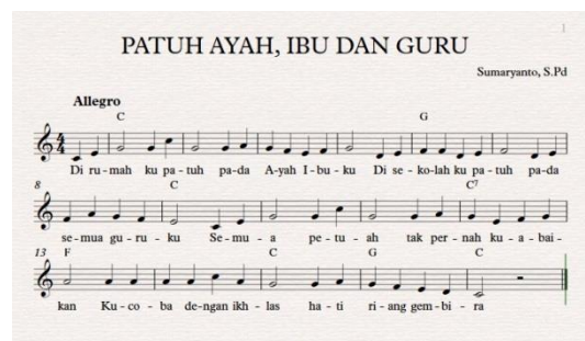
Figure 4. Score of Patuh Ayah, Ibu, dan Guru (Obedient to Father, Mother, and Teacher) Song

This song provides an overview of the actions by a child through the lyrics as follows: At home I obey my mother and father