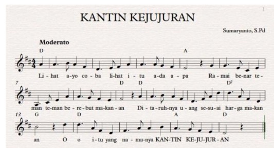
Figure 6. Score of Kantin Kejujuran (Honesty Canteen) Song

The song entitled Kantin Kejujuran (Honesty Canteen) is one of the songs with a familiar theme in children's daily life, especially at school. Canteen is a place in the school, selling a variety of snacks starts from filling to quenching thirst.