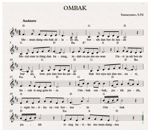
Figure 3. Score of Waves Song

It is different from the previous nature-themed song which clearly contains an invitation to preserve the environment, the ombak (waves) song contains knowledge about what the waves are like. How do they look and color, as can be seen in the lyrics of the Ombak (Waves) song as follows: