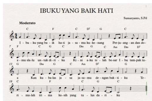
Figure 5. Score of Ibuku yang Baik Hati (My Good Mother) Song

The song entitled Ibuku yang Baik (My Good Mother) is a song that has a devoted theme like the previous song. The difference is this song gives a illustration of a mother in which the mother has a big influence on the child because the mother is someone who has great kindness to the child's life. The lyrics are as follows: