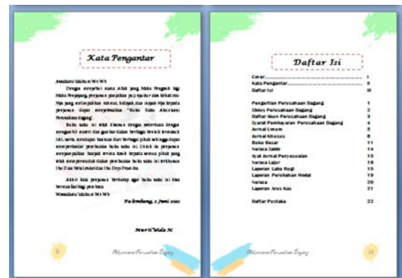
Figure 2. Preface and Table of Contents