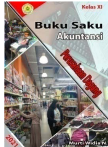
Figure 1. Front Coverigure

can learn independently; The limitation in this research was that the product only presented the basic material of the recording stage, the classification stage, and the reporting stage. In addition, the product trial was only at SMK PGRI 1 Palembang.