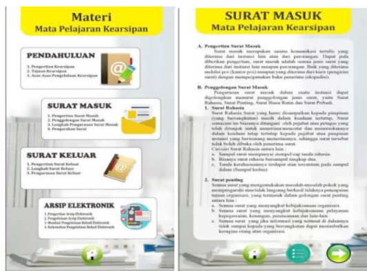
Figure 2. Subject Matter Menu View