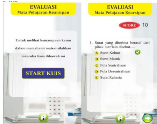
Figure 4. Evaluation Menu View