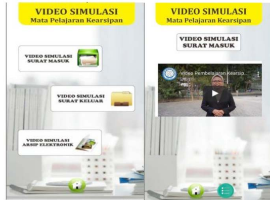
Figure 3. Simulation Video Menu View