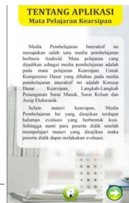
Figure 5. About Apps Menu View

The term multimedia consists of two words: multi and media. Separately it can be interpreted that multi is a word from Latin which is a noun that means many. While