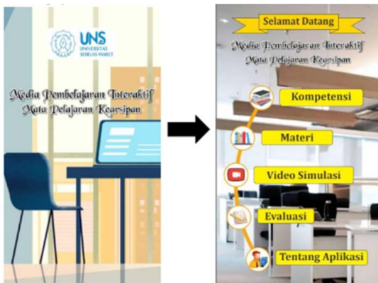
Figure 1. Android-based Interactive Multimedia Initial Menu Display

Here is an overview of android-based archival interactive multimedia: