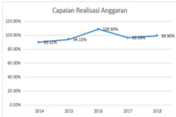
Picture 3. Realization of The Achievements of The Semarang City Budget 2014-2018 (in percent)

Development Planning Board Fiscal Year 2014, has been realized in accordance with the established targets or in other words it has been implemented at 100%.