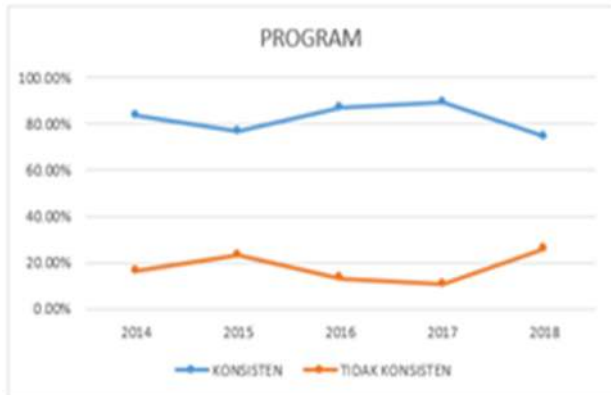
Picture 1. PPAS, RENJA, RKA, and DPA programs

83.33% of the program is consistent and the remaining 16.67% is not consistent. Then in PPAS, RENJA, RKA, and DPA there were 27 activities consisting of 19 activities that were consistent with a percentage of 70.37% and 8 activities that were not consistent with the percentage of 29.63%.