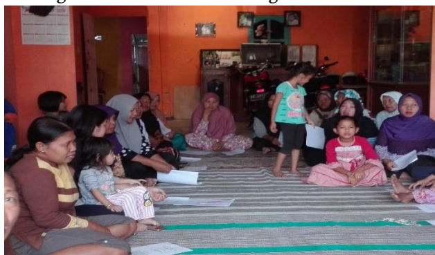
Figure 3. Participants listening to the material delivered by the resource person

The participants were very enthusiastic in participating in the training activities. They'll ask if there's anything that's not yet understood. The documentation of participants when participating in the training activities can be seen in figure 3.