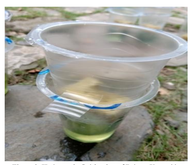
Figure 3. Hydroponic Cultivation of Pakcoy Vegetable Wick System

Based on observations, the trainees were able to practice the material quite well, this was based on the evaluation of the practice of using plastic waste as a hydroponic planting medium. After being given the training, the participants admitted that the training increased their knowledge and skills on hydroponics. In addition, the trainees also understood more about the utilization of plastic glass waste as a hydroponic medium.