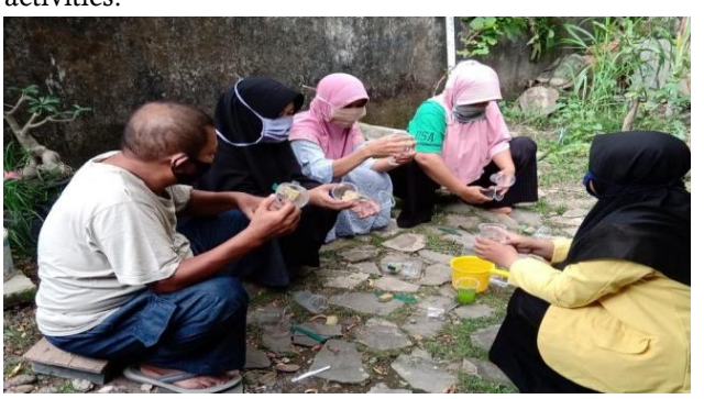
Figure 2. Training Implementation

During the training, participants were very responsive and active in the activities. Participants earnestly and attentively pay attention to the material presented by the presenter. At the time of practice, participants also had a high enthusiasm. This is shown if there are things that are poorly understood, participants will immediately ask, especially in practical activities.