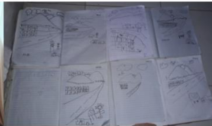
Figure 3. Bimbel Participants' Learning Results