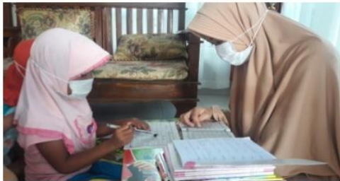
Figure 2. Guidance Ngaji Iqro'

prayers, as well as the skills of origami. Use face to face methods with regard to health protocols. The response of participants in the learning program activities is very signifikan, children who were not initially able to read and write and mention hijaiyyah letters became able to recognize hijaiyyah letters. Then the children also started to be able to write the letters of the alphabet and the numbers 1-10. Children are also able to recite daily prayers including prayer before study, prayer after study, prayer for both parents, prayer before meals, prayer when sneezing and answering sneezing friends. Then learn adab before, when, and after studying,