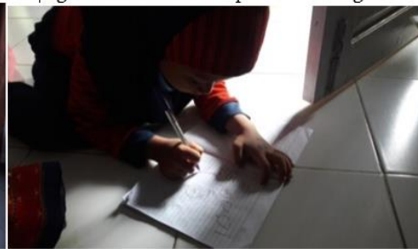
Figure 5. Bimbel with participants

Home learning assistance is felt by the parents of participants and students also becomes beneficial to the environment. Learning guidance is necessary because the role of the teacher cannot be replaced 100 percent by gadgets, because in the process of teaching there are 2 main points that are finding science as well as learning adab or character. Tutoring can go well if there is cooperation between parents and students, tutoring also requires parental guidance.