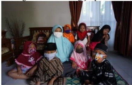
Figure 4. Participation of Bimbel Participants eating, hanging out with peers.