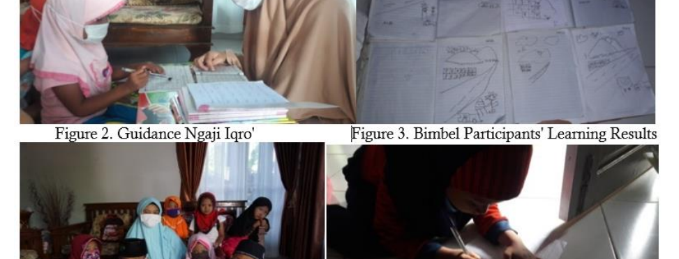
Figure 4. Participation of Bimbel Participants eating, hanging out with peers.

activities. Digital literacy capability is an ability to obtain, understand, and use information coming from various sources in digital form. With law No. 14 of 2005 on Teachers and Lecturers, a professional teacher is required not only to master the search for digital information, but also to master about the validity of the information. Based on the results of the survey to teachers obtained information that their digital literacy capabilities collectively are 65.78% mastering digital literacy, especially related to online learning. Meanwhile, the remaining 34.22% had difficulty using online learning.