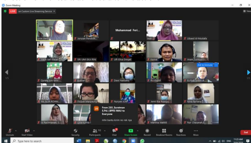
Figure 3. Q&A Session During Activities

PTK can be categorized as qualitative research, because at the time the data is analyzed a qualitative approach is used, without any statistical calculation. It is said to be experimental research, because PTK begins with planning, the treatment or action of the research subject, there are observations, and the evaluation and reflection of the results achieved after the action.