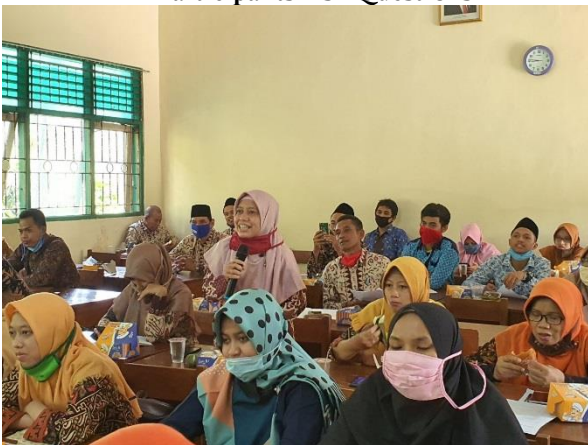
Figure 3. Participants Ask Questions

Evaluation of participants' understanding can be seen during the exposure of the material. Material about growing leadership is first known by participants. So the participants have not understood before. So is the second material on how to build a personal and Institutional reputation. Participants have prior knowledge. The speaker invites dialogue and provides concrete examples. And finally participants have a better understanding.