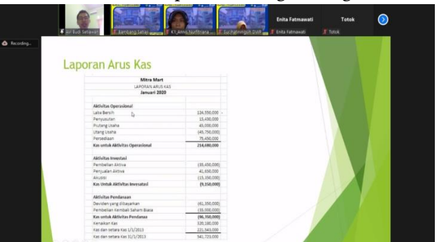
Figure 2 . Financial report recording training

The training and mentoring method combines lectures, case studies, and discussions—small discussions by presenting other villages that already have BUMDes and have managed to grow and develop. The event went well. Participants participated actively