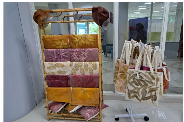
Product Exhibition at the Innovation House