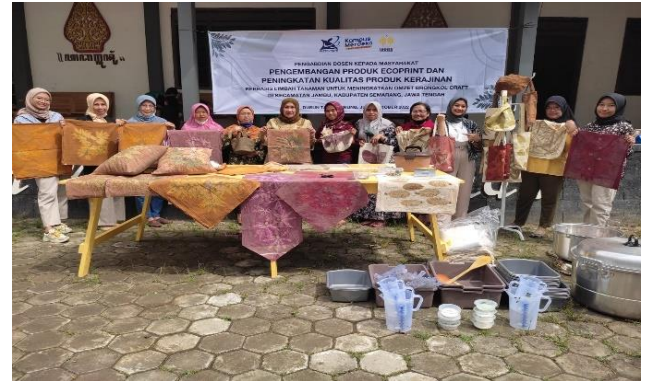
Figure 7. Brongkol Craft Products

The solution provided by the service team to Brongkol craft partners is to increase sales turnover. In addition to product development, the team also provides training related to Management. Training is given by emphasizing the importance of business planning, collaboration and division of tasks in business, doing simple bookkeeping to marketing products. The marketing that has been carried out so far is still word of mouth and offline. The solution provided by the service team is to train Brongkol craft partners to carry out marketing with a broader range of consumers, namely exhibitions. Broccoli products are craft and digital through sales on the marketplace, namely Shopee. Marketing through exhibitions was carried out at the LP2M innovation house, Semarang State University (Figure 8). Marketing is also carried out digitally to solve the problem of partners with low sales levels through Shopee with accounts Broach Craft (Figure 9). It is hoped that digital marketing will increase sales turnover and partners' welfare levels will increase.