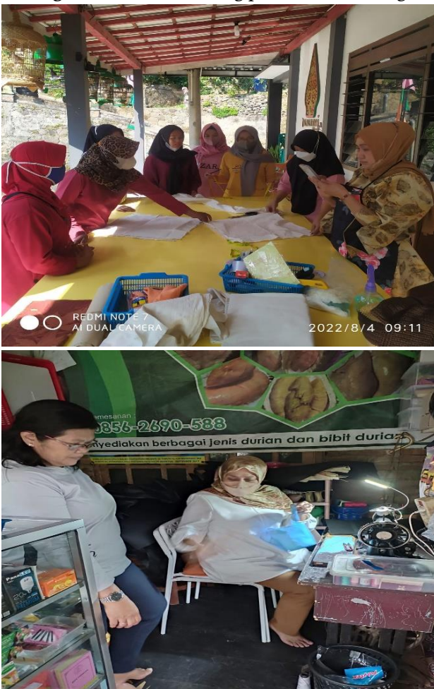
Figure 6. Practice making patterns and sewing

Pattern-making and sewing training carried out by the service team for Brongkol Craft partners has produced functional products that can be useful and have selling points. Brongkol craft products include tote bags, guest chair cushion covers, tablecloths and hats, as shown in figure 7.