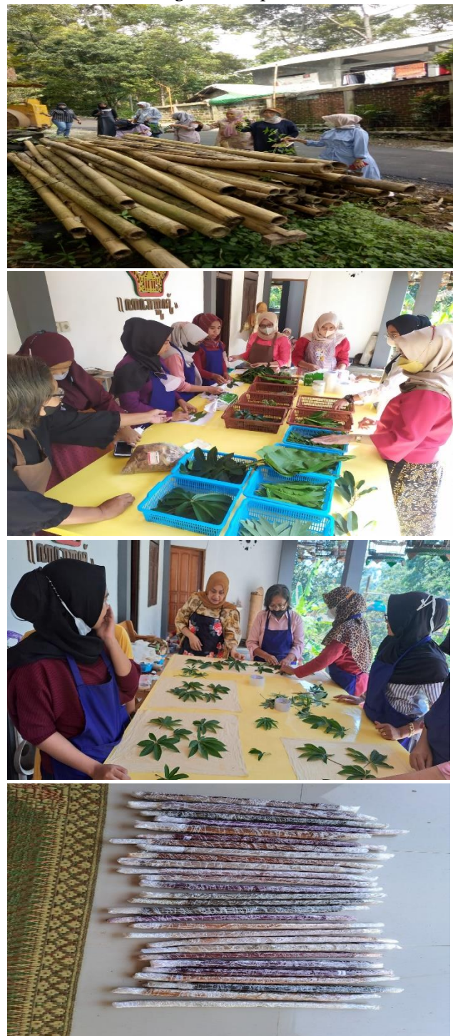
Figure 5. Production Process and Products of eco-print Brongkol Craft partners

Ecoprint product development solutions , skilled partners produce ecoprint fabric products from various types of waste leaves originating from brongkol village through production stages to produce fabrics as shown in figure 5