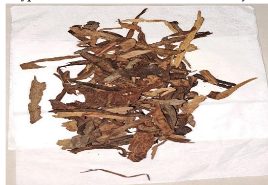
Types of Leather that Can Be Used as Dye