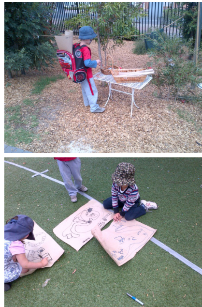
Figure 4. The exploration journey: making a map

Those two samples indicate the same characteristic of deep and meaningful learning: children engaged in the same topic. They worked within the area for long period of time and the teacher extended their experiences from time to time. The unrestricted time gave them opportunities to explore various concepts such as language, problem solving, cooperation, numeracy, science, and even arts