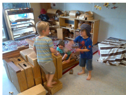
Figure 1. The beginning of the horse construction

Their play lasted for more than 3 days. Their horse construction got bigger and complex. Some other children joined to the play and brought complexity to story: the horse, the king, the prince, and the princess.