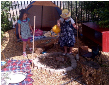
Figure 3. Children pretending to boil the water

On the next day, I set up a circle stones as if it was the fire place.