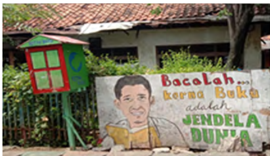
Figure1. Reading box in the Village of Literacy, Jatipulo, Central Jakarta