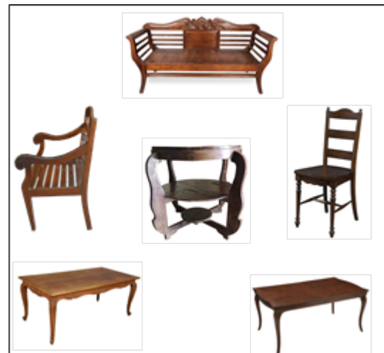
Picture 1. Classical Furniture of Tables and Chairs

The shape of classical furniture produced by the craftsmen were tables and chairs. The characteristic of classical furniture shape is used curve line. Although some of the furniture combines straight and curve line but the curve line still dominates. Beside that, the legs of the tables and chairs produced have a more pointed shape. If it is understood the characteristic of aesthetical shape of classical furniture produced by the craftsmen in that village and then it is related to several classical furniture styles, the furniture produced by the craftsmen in Tempel village tends to have Perancisian style. Example of classical furniture in the shape of tables and chairs can be seen in the picture 1.