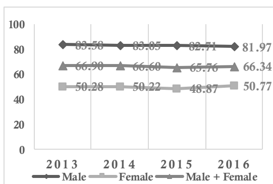
Figure 1. Indonesian Labor Force Participation Rate in August 2013-2016