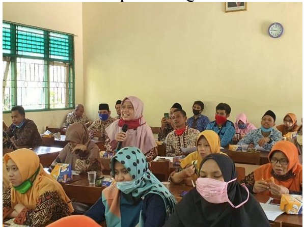
Figure 3. Participants Ask Questions

Evaluation of participants' understanding can be seen during the exposure of the material. Material about growing leadership is first known by participants. So the participants have not understood before. So is the second material on how to build a personal and Institutional reputation. Participants have prior knowledge. The speaker invites dialogue and provides concrete examples. And finally participants have a better understanding.