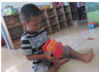
“Lt” Children with other disorder interested to play that puzzle 3D

. Although not all the autistic interested directly against that this, but except the son autistic are also interested to use that this. Interest that is unusual shown by the son autistic by direct means take and played it.