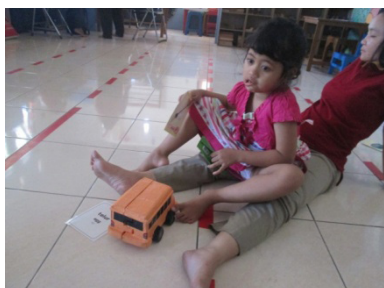
Reaction "Ar" do not want to put that puzzle 3D

Various kinds of reaction from the autism if they do not can play with the puzzle puzzle 3D most like leaving puzzlenya just like that and during this child autism in office never show reaction tantrum ( raging , crying and screaming or even hurting himself ) if it does can do it