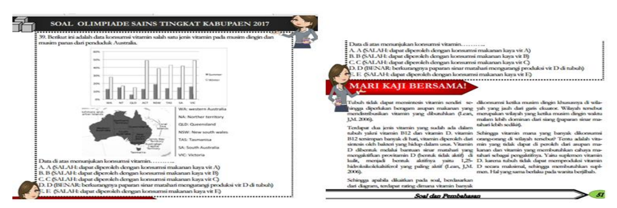
Figure 3.1 Patterns of discussion of high school biology Olympic questions

media experts, with the validation value obtained of 94.6 with very valid criteria. So that the average value of module validity obtained based on material experts and media experts is 86% with very valid criteria. The assessment data from both material experts and media experts are then used as the basis for revising the development of module based on biology Olympic questions.