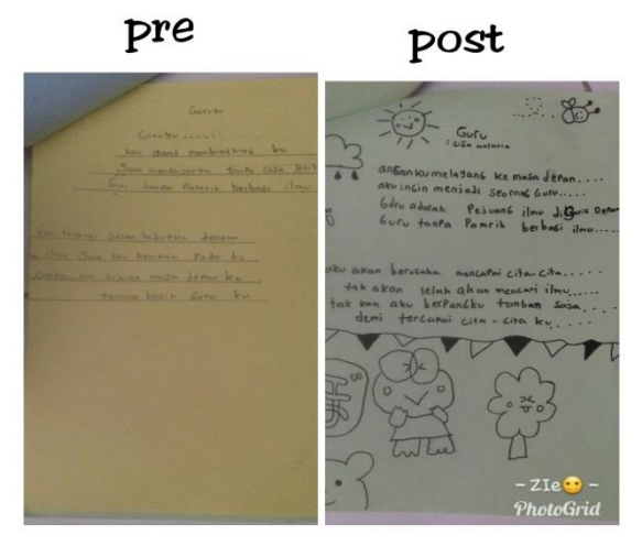
Figure 3. The Example of Product

For the final product of this research there in a form of colorful book with contains of students' poetry. The example of product as presented in Figure 3.