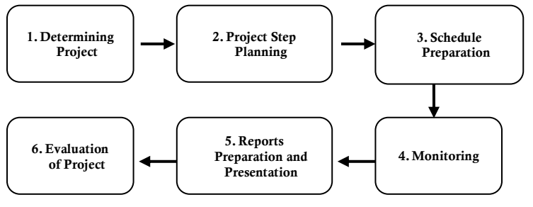
Figure 2. Syntaxes of Project Based Learnig Model

This study is a study that is testing a learning model, while learning model tested is Project Based Learning model. Usually the project based model is commonly applied in science subjects but in this study the project based learning model will be tested on poetry writing skill. The following stages in the project based model as presented in Figure 2.