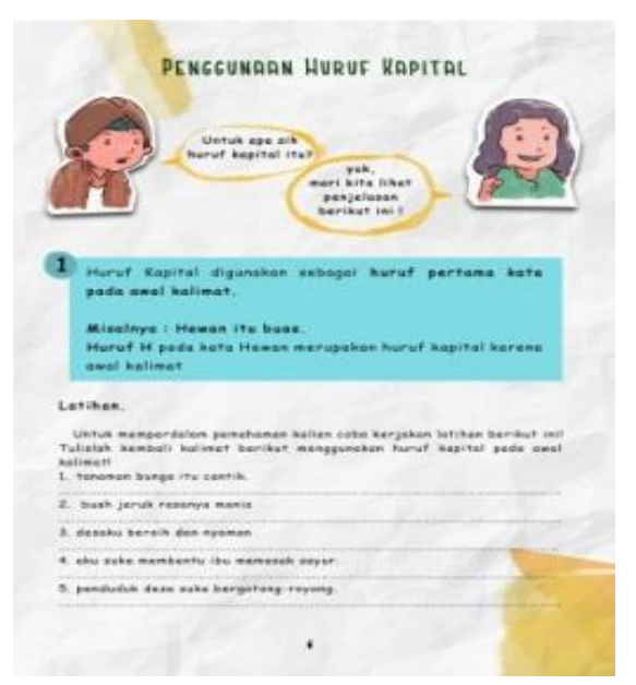
Figure 8 . Presentation of Material After Revision

The fourth improvement is changing terms and spelling show the results of improvements in the conversion of "uppercase" terms into "capital" letters.