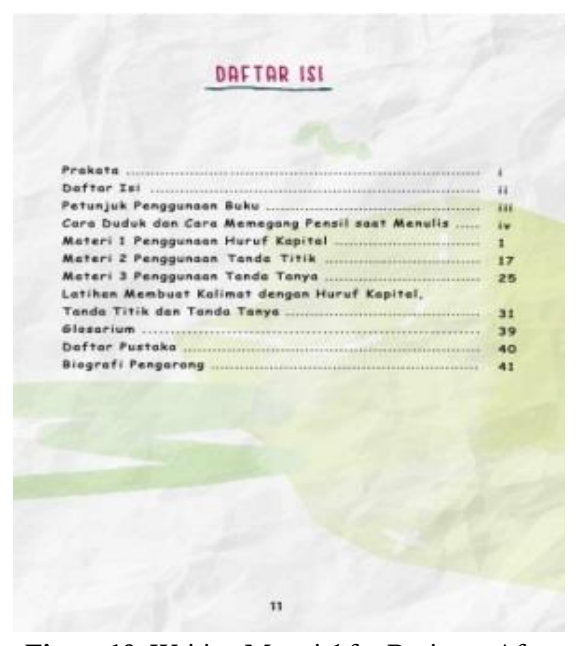
Figure 10 . Writing Material for Beginner After Revision

After further revisions, the supplementary book is trialed in a limited and broad-scale trial. A limited scale trial is conducted toward 10 students of second grade of State Elementary School Mungkid 2. After that, observation and content tests are carried out in the small scale trial process. Next, the supplementary book product is revised. After that, the supplementary book product is tested on a broad scale.