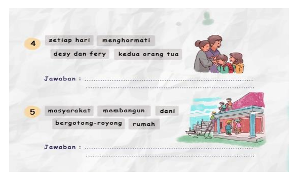
Figure 3. Values Containing Local Wisdom

Local wisdom content stimulates student to create question sentences.