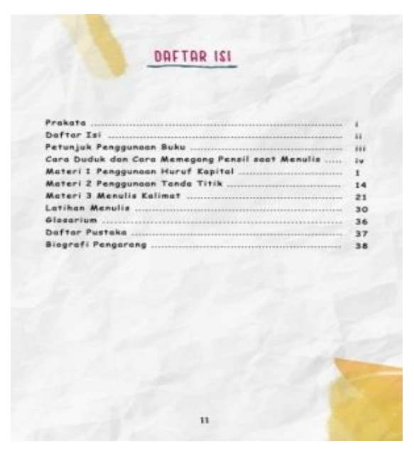
Figure 9 . Writing Material for Beginner Before Revision

The fifth improvement is the focus of writing material for beginner from writing material sentences with capital letters and periods into writing material sentences with capital letters, periods, and question marks presented in Figure 9 and Figure 10.