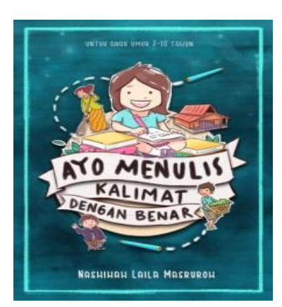
Figure 4 . Title of Supplementary Book Before Revision

The results of the validity test show that the supplementary book is feasible to use, however, there needs to be an improvement by considering input from the validators. The improvement is the title of the book. The validator requires the title of the book to be focused on the material in the supplementary book. Figure 4 and Figure 5 show the results of the improvement of the title of the supplementary book.