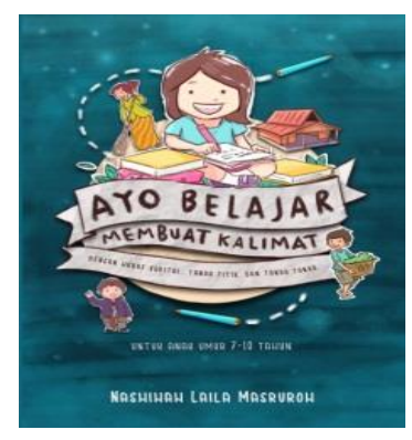
Figure 5 . Title of Supplementary Book After Revision

The second improvement is the addition of the intended use of the book shown in Figure 6.