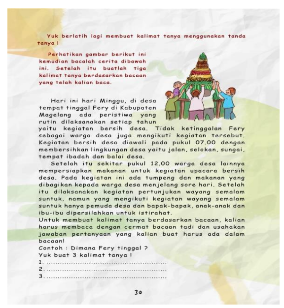
Figure 1 . Simple Story with Local Wisdom Content

Local wisdom content in the form of simple stories gives students knowledge about the local culture that needs to be preserved.