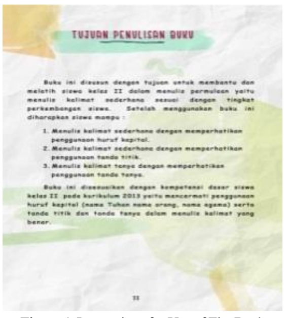
Figure 6 . Instructions for Use of The Book

The second improvement is the addition of the intended use of the book shown in Figure 6.