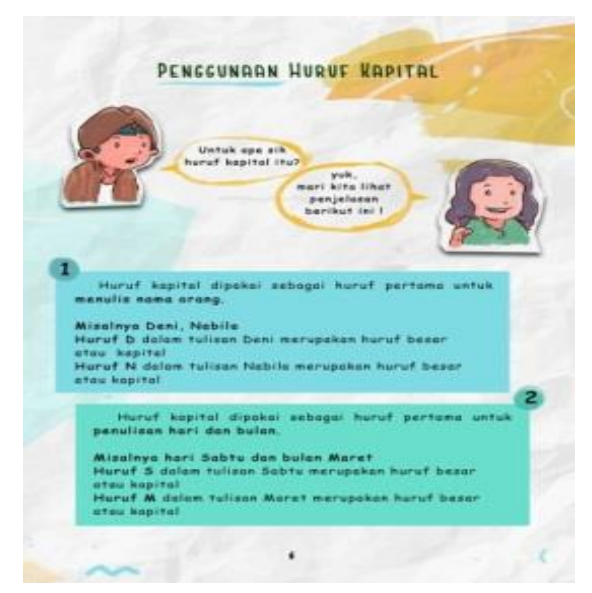
Figure 7 . Presentation of Material Before Revision