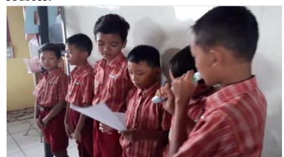
Figure 5. Verification

obtained information as conceptual construction and generalization so they could find their own knowledge from the alternative answers which required logic proof based on various obtained sources.