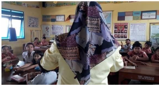
Figure 6. Generalization

The fifth phase as in Figure 5, verification, after the data was collected and processed, the students were asked to present the report results to find out suggestions and rebuttals from each group or student. Thus, the previous data could be used as problem formulation in the form of hypothesis and could be verified.