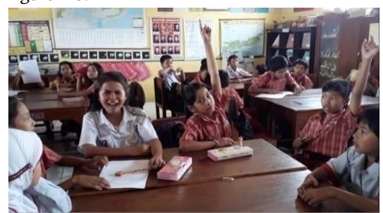
Figure 1. Stimulating

The syntaxes of discovery learning assisted by interactive video are presented in Figure 1-6.