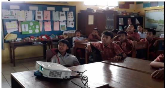
Figure 2. (Questions)

On the first phase as in Figure 1, the stimulation, the students were given questions and a video was presented to elicit their thoughts and to start asking questions based on the explanation in the video.