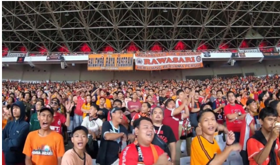
Figure 1. The Jak Mania sang Kesurupan

Hari ini kutinggal pekerjaan Siap-siap untuk nonton pertandingan Orang bilang aku ini kesurupan Demi Persija apapun kulakukan Persija Jakarta OOOOOO Persija Jakarta OOOOOO Persija Jakarta OOOOOO