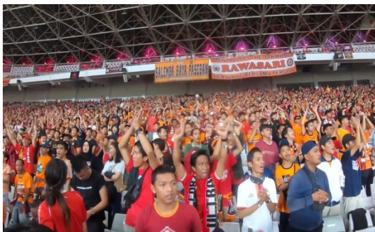
Figure 2. The Jak Mania excitedly supported Persija

Hari ini kutinggal pekerjaan Siap-siap untuk nonton pertandingan Orang bilang aku ini kesurupan Demi Persija apapun kulakukan Persija Jakarta OOOOOO Persija Jakarta OOOOOO Persija Jakarta OOOOOO