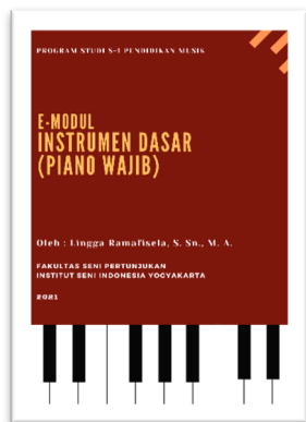
Figure 1. Screenshot of Cover E-Modul

started with playing one octave first, then extending it to two or more octaves. Scale is a collection of sequential notes and has a pitch according to the applicable rules. The scale exercise is a basic piano practice. This e-module uses attractive pictures to help students interpret more accurately every instruction in it. The following is the appearance and link of the e-module for the compulsory piano course: https://bit.ly/e-modulpianowajib