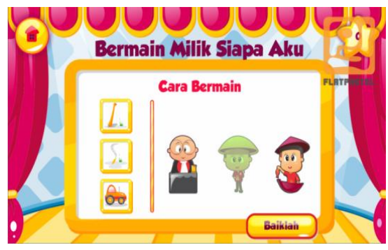
Figure 8. Game "Jelajah Karir Bersama Nina"