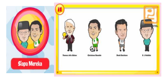
Figure 6. Menu Who They Are