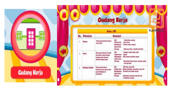
Figure 7. Menu Warehouse Work