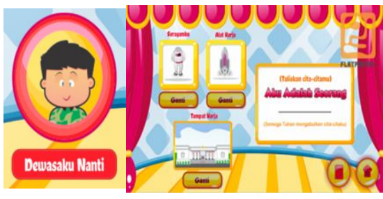
Figure 9. Menu My Adult Later

The data collection technique used in this study was to use a career recognition scale consisting of 35 items. Based on the validity and reliability test of item items, it is known that the career recognition scale was initially 40 items, 35 items were declared valid and 5 items were declared invalid. The results of the calculation of the reliability test scale of career recognition for students a number of N = 21 students with Alpha formula obtained a reliability coefficient of 0.95.