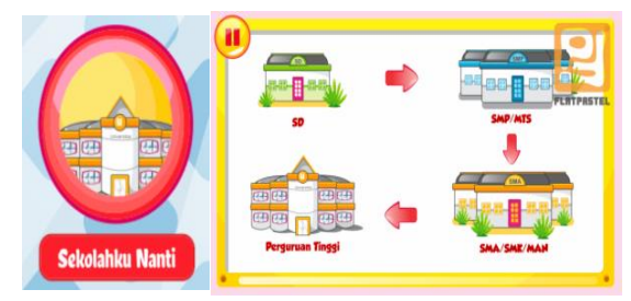
Figure 5. Menu My School Later