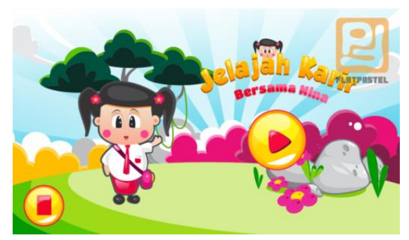
Figure 2. Main Display

This game is made in the form of a CD and in the form of an android application, to facilitate the class teacher or counselor in using the media guidance to adjust the infrastructure facilities owned by the school.