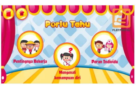
Figure 4. Menu Needs to Know