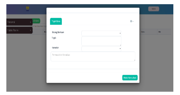
Figure 3. Student Page Views