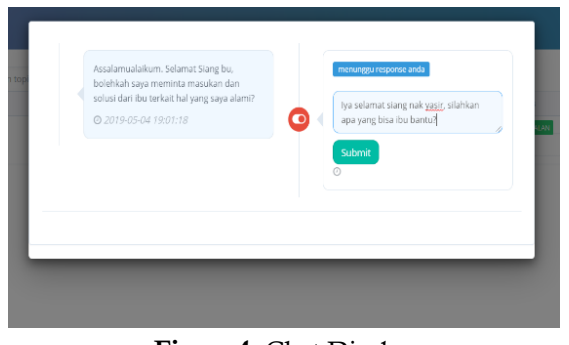
Figure 4. Chat Display