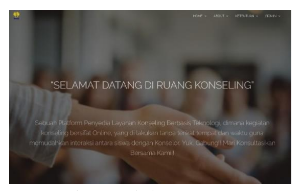
Figure 1. Display Front page

The implementation of web medium-based Cyber Counseling to improve students' counseling interest had the basic format of the communication interaction among individuals, namely counselors with counselees through chatting feature which has been adjusted to the needs of students. It covered a history of counseling that has been passed, printed version of the history of consultation as assistance in the follow-up of Face to Face counseling, assistance fields, user profiles, etc.