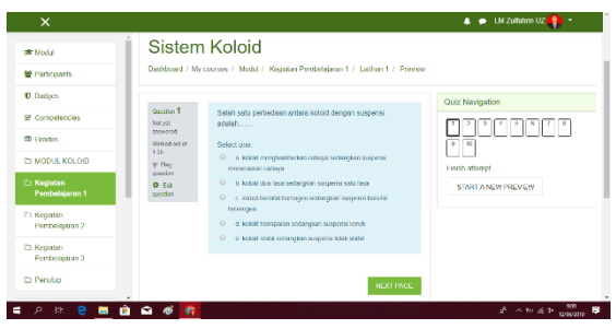
Figure 4. The View of Formative Test on e-Module of Chemical Based on Problem-Based Learning

subchapter aimed at knowing the ability of the students after studying the materials of each subchapter. The formative test consists of 10 double-choice questions and is equipped with assessments so that students can measure their abilities related to the subchapters that have been studied. In other words, a formative test in an emodule is a condition that students must meet to see if the student has mastered the material being taught and can proceed to the material in the next subchapter.