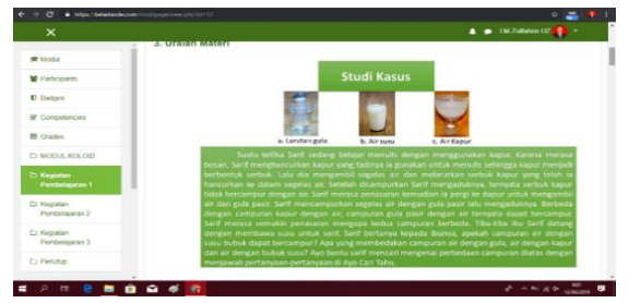
Figure 1. The View of "Studi Kasus" on e-Module of Chemical Based on Problem-Based Learning

The problem-based chemical e-module is developed starting with the "Studi Kasus" in each subchapter. The problems presented are the problems that students often meet in daily life. The problem presented in the e-module is an illustration of events related to the real world.