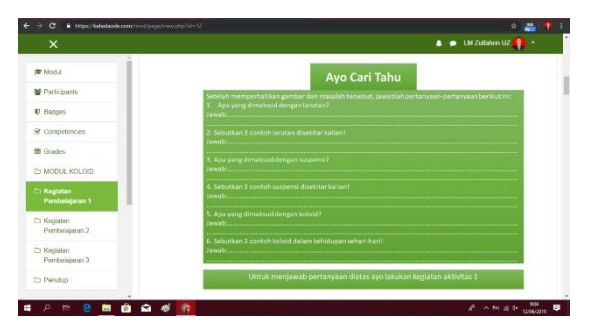
Figure 2. The View of "Ayo Cari Tahu" Column on e-Module of Chemical Based on Problem-Based Learning

After students have given the problem to solve, the teachers organize the students by dividing students into groups and telling students to answer the questions in the "Ayo Cari Tahu" column in the e-module relate to the material to be studied. By answering these questions, students are directed to be able to solve the problems are presented.